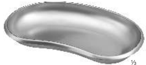
Nierenschalen Kidney bowls Bassins réniformes Cuñas