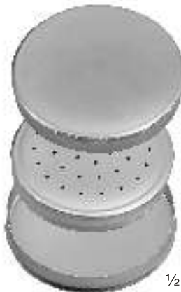
HB 9092 6,5 x 1,5 cm