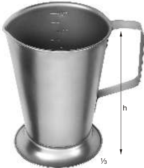
Messbecher Measuring jugs Gobelets gradués Copa graduada