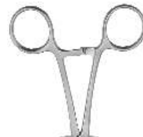
Standgefäß Jar Récipient Tarro